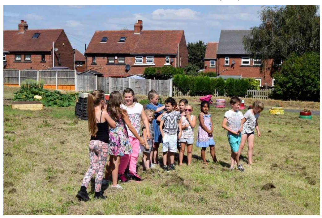
The alternative Olympics

Include gardeners on the Management Board